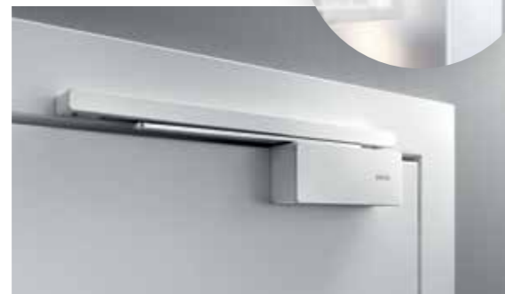
Extremely easy to install: the surface-mounted GEZE ActiveStop for timber and glass doors.