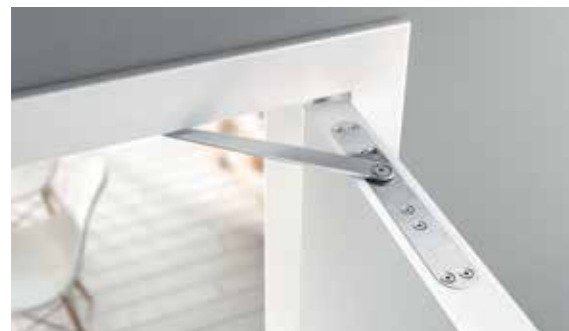
Conforms to the most demanding design requirements: the integrated GEZE ActiveStop for timber doors.

Choose the right version for your door situation: